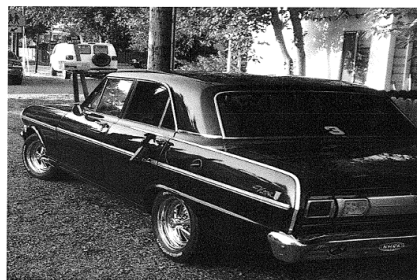
1965 Chevy Nova/Chevy II original California Car =Black Plate